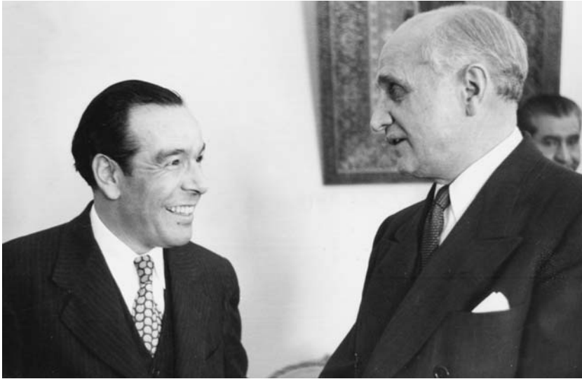
The campaign against Mossadegh intensified after an anti-Mossadegh diplomat, Loy Henderson, arrived as American ambassador. Henderson (right) is shown talking to the ill-fated Foreign Minister Hussein Fatemi.